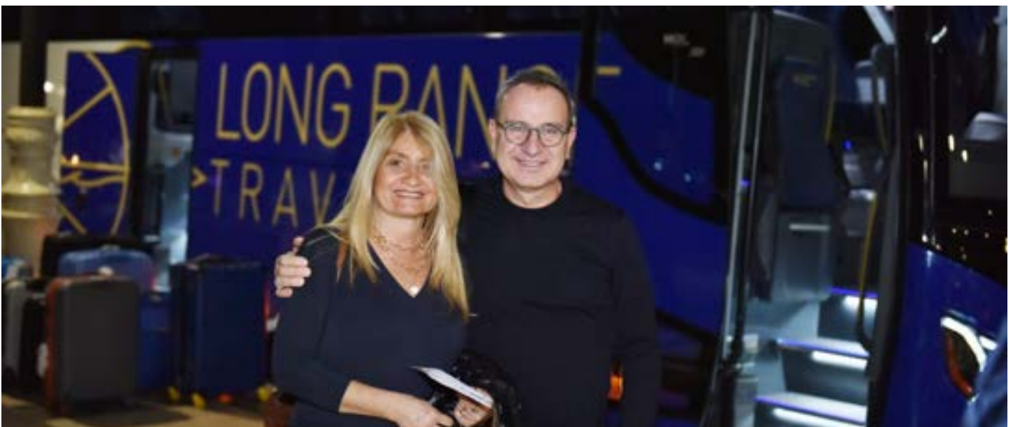
Snippets from our first TIA cruise tour arrival January 8, 2024