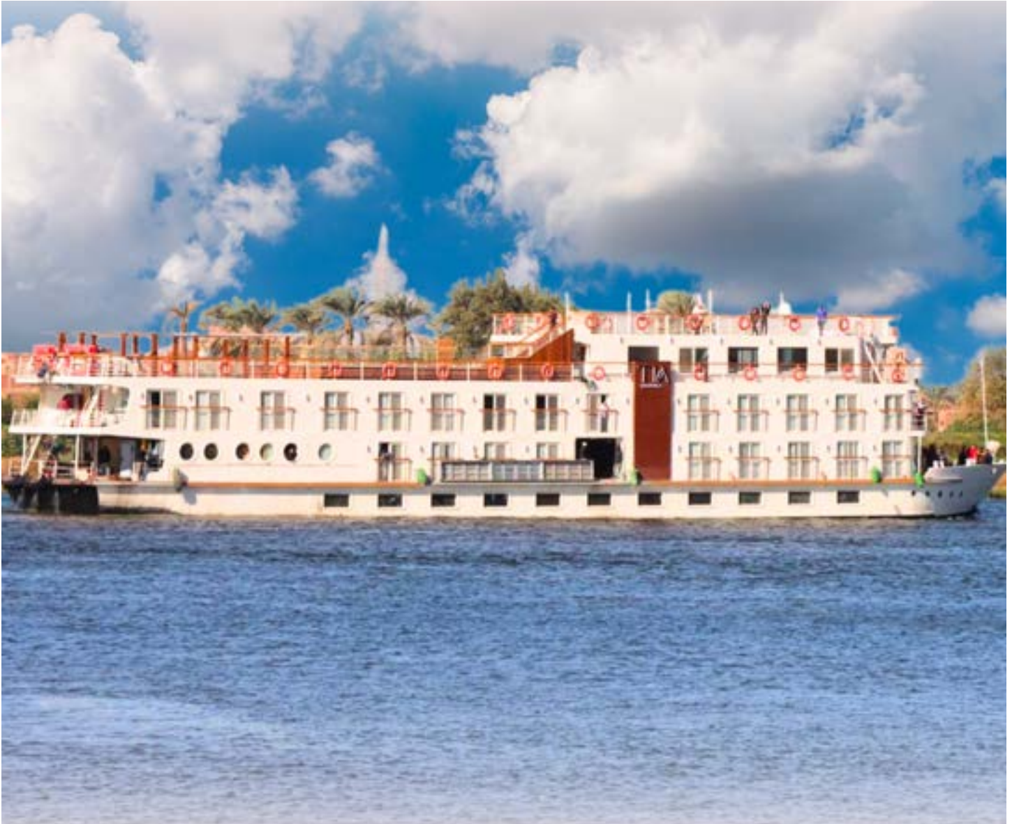
1. TIA NILE CRUISE

By diversifying our portfolio with these unique cruise experiences, we are poised to capture a broader segment of the market, appealing to a diverse range of travelers seeking opulence and adventure. This venture not only cements our reputation in the luxury travel sector but also sets the stage for substantial growth and increased market presence, as we continue to redefine the standards of high-end river cruising.